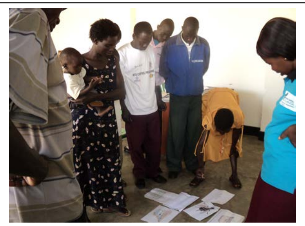
Mapping of diahrreal disease transmission during TOT training (Dec. 2011)