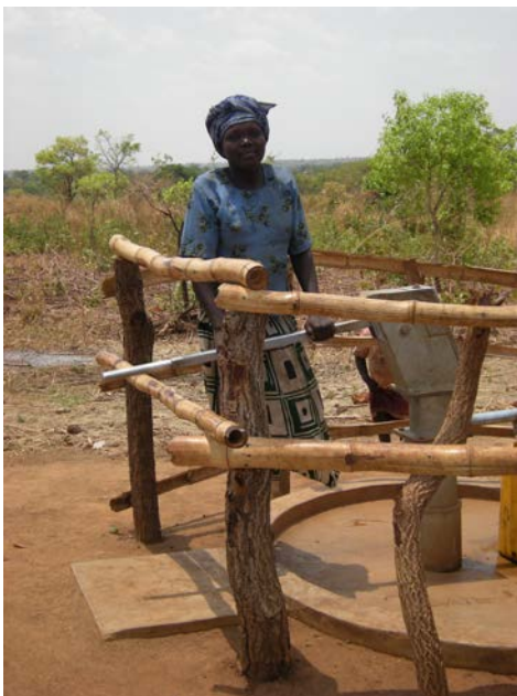
Te-Olam Village well in Aromo, March 2012.