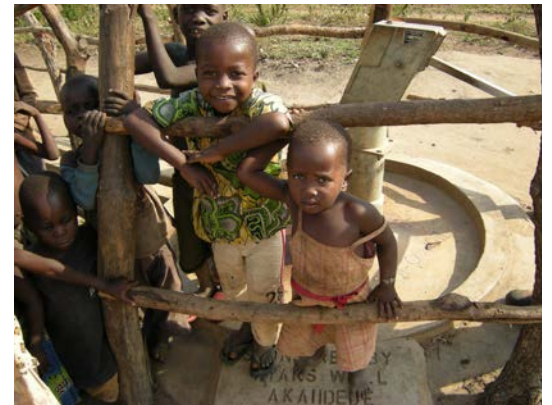
Akaiidebe Village well in Aromo Sub-County.

"From when I was four years, my mother was always attending to me. I couldn't go to school because, just like me, my sister was sickly. Therefore, I was always left to take care of my younger sister and also look after the animals. This interrupted my studies and the doctor advised my mom to start boiling our drinking water because our source was contaminated. With this new well I hope I will not fall sick again in our home to interfere with my studies."