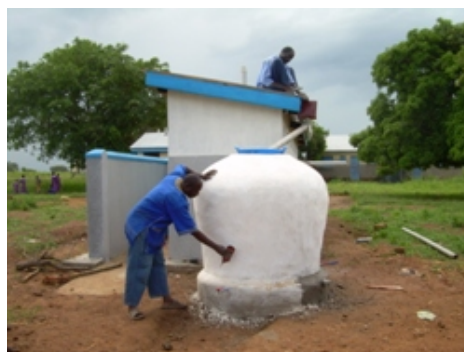
Divine Waters field crew finishing latrine and rainwater jar at Agak Primary School.